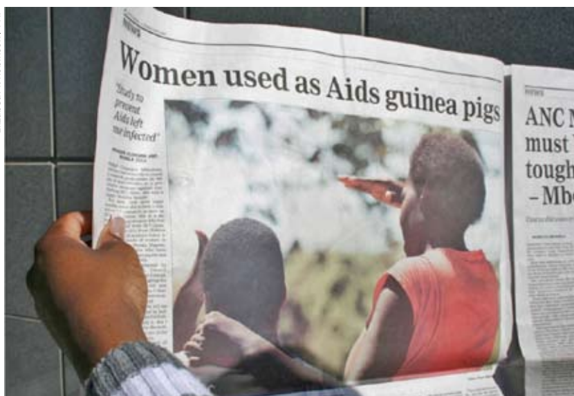
Article on HIV prevention trial in South African newspaper, February 2007.